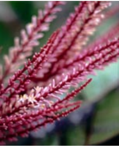
Clockwise from above left: ready for the lunchtime service in the dining room of the Red Ochre Grill; salt-and-native pepper leaf prawns and crocodile with Vietnamese pickles and lemon aspen sambal; the leafy verandah setting of Perrotta's, adjoining the Regional Art Gallery; flowers in bloom at Sea Temple Resort and Spa.